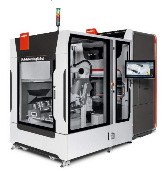
[03] A "mobile bending cell" makes conventional press brakes fit for automation

But this is not the only application for wireless switches in Xpert plants. Bystronic has also developed a solution whereby a "normal" press brake can work totally automatically if required. A mobile robot cell, with a six-axis robot which references itself to the press automatically, is positioned in front of the press. The robot removes sheets of metal from the integrated stack, positions them precisely, initiates the bending process, grasps the metal several times and then throws out the finished parts.