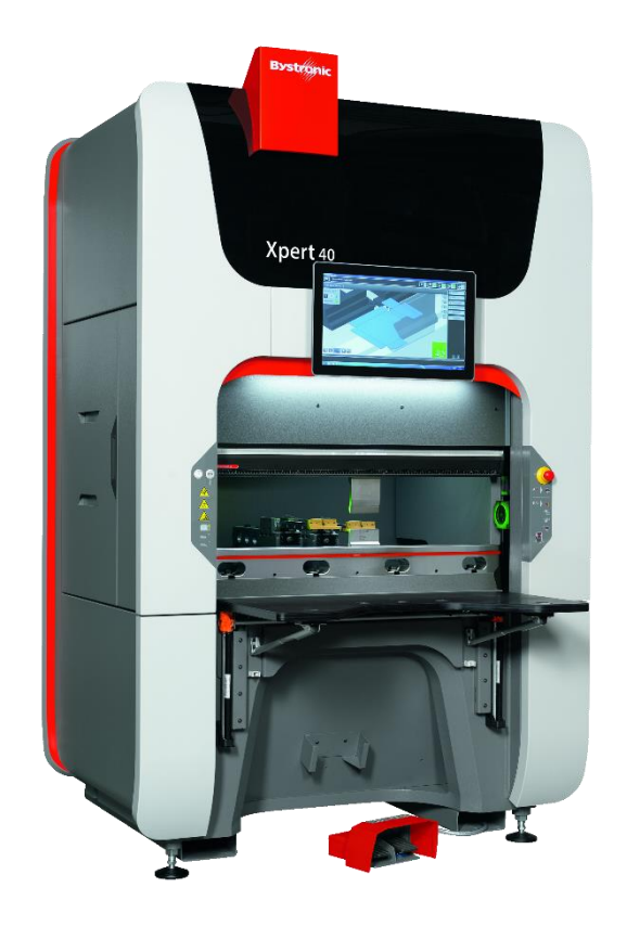
[01] The Xpert 40 press brake from Bystronic is fast, flexible and suited to many different applications

Wireless switching devices mean a high degree of flexibility. One example of this is in the press brakes made by Bystronic, where mechanical engineers employ remote control technology from the steute Wireless range, e.g. for communication between a press brake and a "mobile bending cell" automation unit.