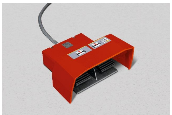
[02] A foot switch – cabled or wireless – is the central control element of a press brake

the upper cheek of the press then moves down, bending the part as desired. For the observer this looks like a very rapid sequence of grasping (the sheet metal part), operating (the foot switch) and a downward movement (the upper press parallel, cheek). In the stoppers automatically position themselves so that the parts can always be placed correctly. If the operator needs to make a correction, for example because the angle of bend is inaccurate, he opens the tool using the second foot switch pedal.