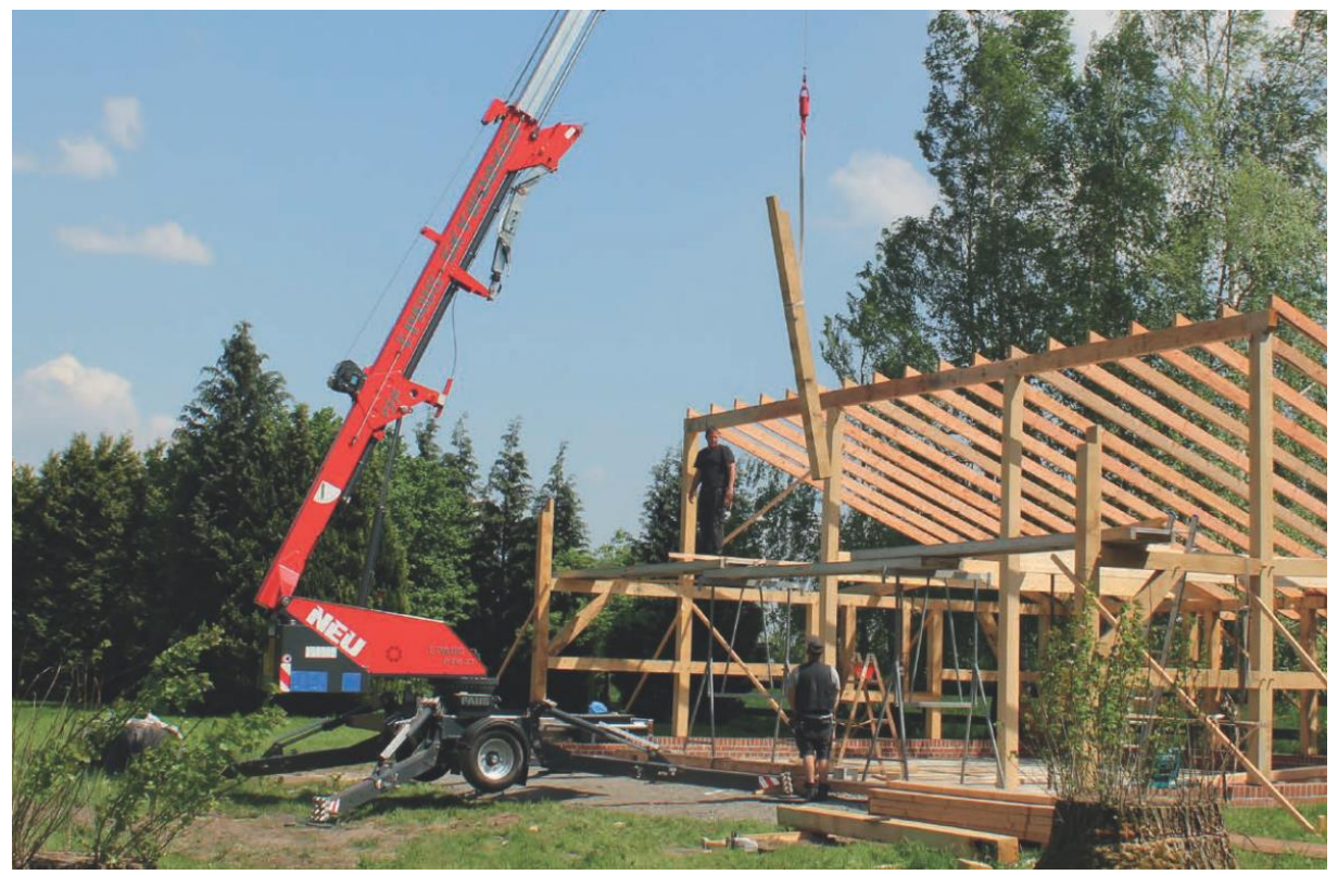
The Sky Worker PTK 27 aluminium trailer crane was developed especially for compact spaces

Wireless means cable-free: with this motto in mind, Paus is fitting its Sky Worker PTK 27 crane series with special safety equipment. Wireless switching devices monitor the position of the crane hook and the extension status of the telescopic parts. The crane engineers have managed to develop a solution which is as reliable as it is affordable.