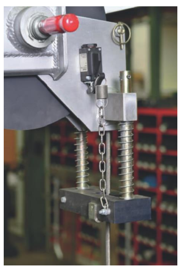
A wireless pull wire switch causes the winch to stop when the hook block reaches its upper limit

flexible. For this reason, nearly all telescopic cranes – from small cranes for roofers to 500-tonne giants – are fitted with (often very visible) spring-driven cable reels to wind and unwind the cables